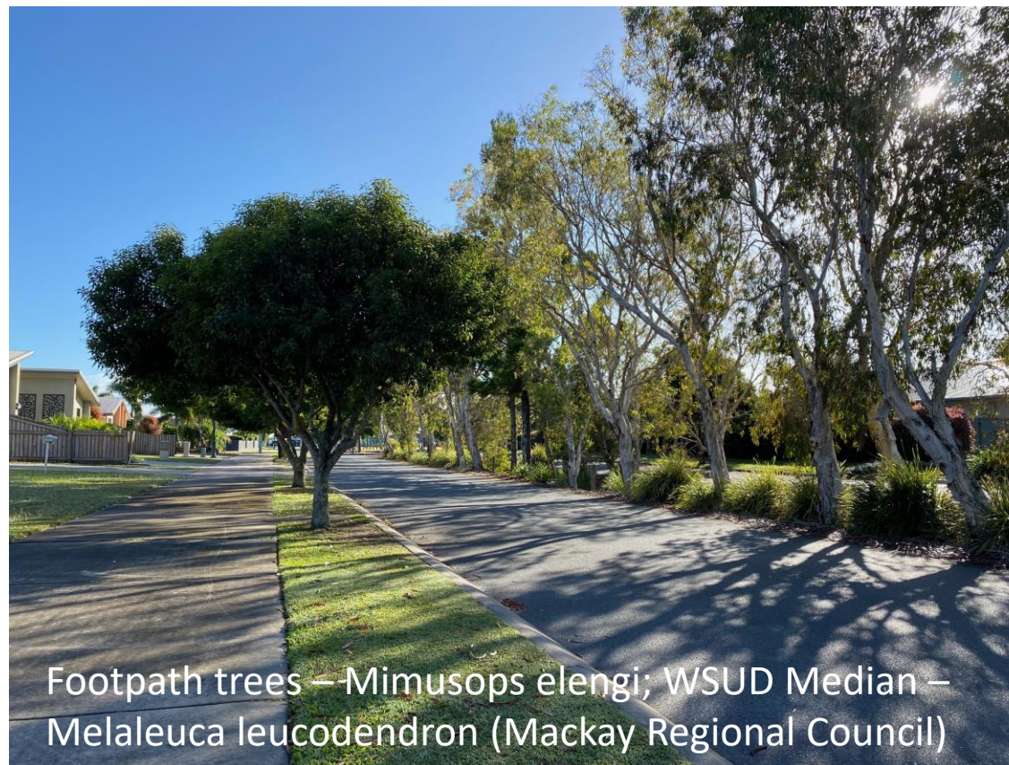
Footpath trees – Mimosa elengi ; WSUD Median – Melaleuca leucodendron (Mackay Regional Council)